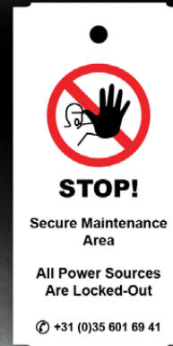
White Custom Message*