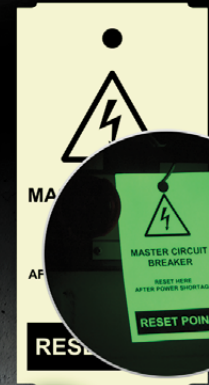
NEW! ReGLO Glow-in-the-Dark